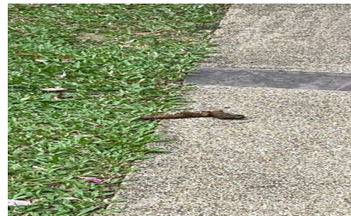
In front of Block 62 (13 Aug 21)

We appeal to all pet owners / maids to exercise due consideration and observe good hygiene and estate's cleanliness. Kindly bring along extra plastic bags and a bottle of water to dilute their pee or clear their "droppings".