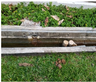
In front of Block 58 (27 Jul 21)

Below are some of the pictures of these incidents at various locations which we would like to share with you. Such sights are disgusting to our other residents and visitors.