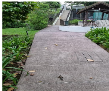
In front of Block 46 (13 Aug 21)