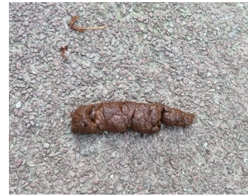
Behind Block 72 (13 Aug 21)