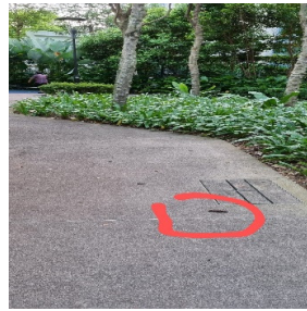
Behind Block 72 (30 Jul 21)