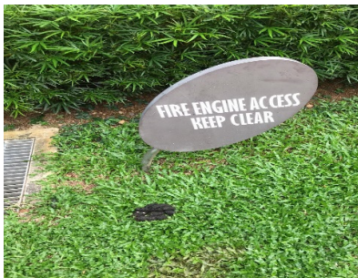
Behind Block 66 and 68 (13 Aug 21)